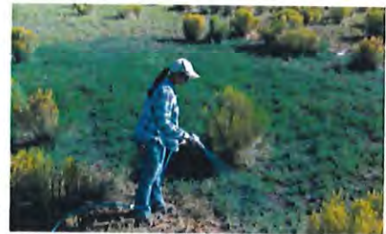
Spraying Weeds at Flying M Ranch

Funding Agency/ Agreement Number: WBC / Flying M Location: Flying M Ranch Start Date: 4/15/2017 End Date: 8/15/2017