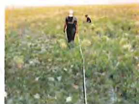
Monitoring in Desert Creek Area

The National Fish and Wildlife Foundation (NFWF) granted funds to Mason Valley Conservation District (MVCD) in July, 2015, to educate and train young conservationists between the ages of 18 and 25 in conservation practices. Since the inception of this grant in 2015, two youth have planted and irrigated containerized stock, maintained irrigation systems, and sprayed for noxious weeds. In the Desert Creek area, the youth performed monitoring of the medusahead treatment area, spot treatment of medusahead, and installation of fence markers to prevent Sage Grouse from colliding with the wire fences adjacent to the