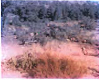
China Camp showing lopped and scattered Pinyon

In February of 2013, the US Fish and Wildlife Service Partners Program (FWS) granted Mason Valley Conservation District (MVCD) $25,000 to construct a “let down” fence on the Flying M Ranch to benefit the Bi-State Sage Grouse. The project languished until 2015 when the FWS suggested changing the project to Pinyon Juniper removal in the China Camp area of the ranch to open up a meadow and spring area which allows the Sage Grouse to rear their chicks with less danger of predation from ravens. The work was planned through several field trips to the site through the summer of 2015. Also in 2015, the property was purchased by the National Fish and Wildlife Foundation. The planning was completed in the fall of 2015, but by the time all of the permissions to enter the property were received, the site was too wet to access.