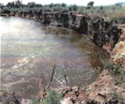
Mitchell Bank Stabilization

In November, 2016, the Mason Valley Conservation District received recognition from the Nevada Association of Conservation Districts as the Outstanding Conservation District in Nevada. This honor was shared with the Smith Valley Conservation District.