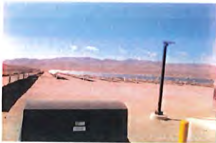
Luning Energy Solar Plant

In December, 2016, Luning Energy Inc. completed construction on their 50 megawatt solar energy plant just northwest of Luning, Nevada. One of the conditions of the Environmental Assessment was that the company provide $140,000 to be used for invasive and noxious weed control in Mineral County. An agreement was signed between Luning Energy, Bureau of Land Management, the Wilderness Society, Friends of Nevada Wilderness, and the Mason Valley Conservation District (MVCD) in which MVCD receives the money, receives project requests from the partners, seeks comment, and volunteer labor from the partners, and coordinates the work to be done. Introductions among all parties were made at the open house/ribbon cutting in April. MVCD will receive a seven