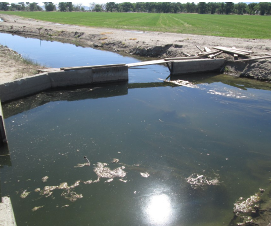
Campbell Canal Split Structure

The Bureau of Reclamation (BOR) has awarded the Mason Valley Conservation District (MVCD) a WaterSMART grant to reconstruct an irrigation structure where the Campbell Canal splits into the East and West Branches. MVCD researched extensively, submitted the grant application, and will administer the grant through completion of the project. Walker River Irrigation District is scheduled to do the construction. An extension of the grant has been requested because BOR has not yet approved the cultural report. Completion is expected before the beginning of the 2022 irrigation season on March 1, 2022.