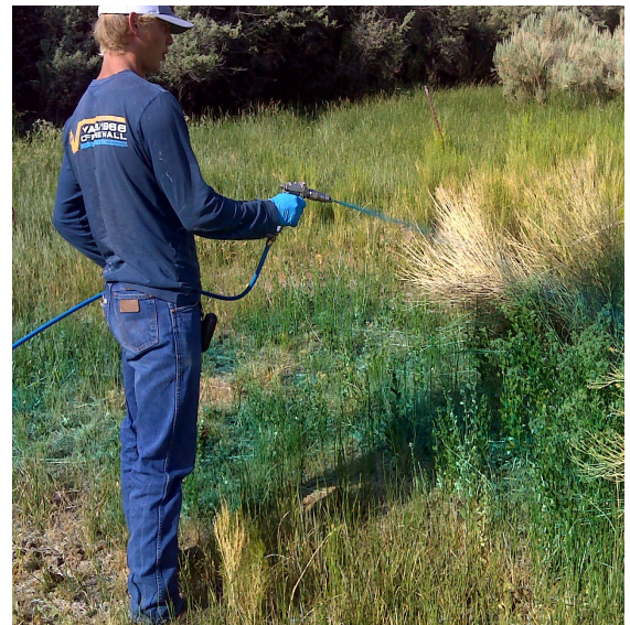
Inventory, Mapping, and Treatment of Noxious Weeds Along the Walker River Riparian Corridor