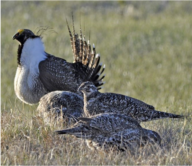
Bi-State Sage Grouse

The Mason Valley Conservation District applied for and received a multi-year grant from the National Fish and Wildlife Foundation to inventory, map, treat, and control noxious weeds in the Walker River Floodplain. This grant is for a three-year period, and began March 1, 2021 and continues through September 30, 2023. This project complements the Walker River Watershed Weed Control Project reported on page 1.