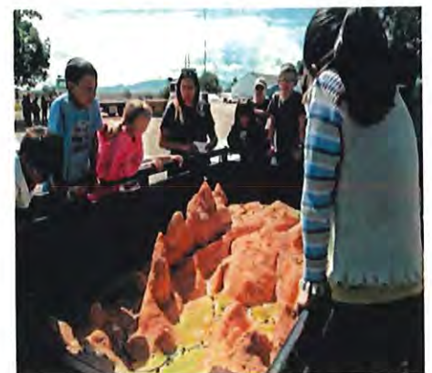
Mason Valley Elementary End-of Year Celebration

The Smith Valley Conservation District (SVCD) participated in one event at the Mason Valley Elementary School this year. This was the end of the year celebration. SVCD showed the Walker River watershed model to students and their parents, many of whom had never travelled outside of the boundaries of Mason Valley. The Conservation District was able to show how the places in the watershed were interconnected.