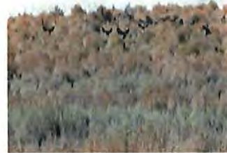
Mule Deer bedding down in treated area

As we completed the tree removal, we were able to observe several Mule Deer begin to use the site. The project area was adjacent to pastures where the trees and brush had already been removed, which created a larger area for wildlife to use with less predation.