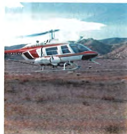
Aerial application of a pre-emergent herbicide to control medusahead and cheatgrass on a private property in Smith Valley

The Conservation District received a second grant from the Nevada Department of Agriculture to augment our efforts on the Desert Creek property. This grant provided funds and guidance for monitoring of the project as well as contingency funds in the event another treatment was required.