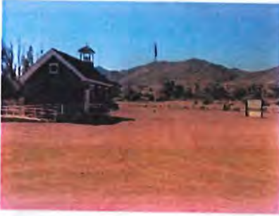
Smith Valley Historical Site after spraying weeds

Smith Valley Conservation District (SVCD) started a new endeavor this year to treat weeds on private property as a service to the landowners. These services will be billed directly to the landowner based on the chemical used, the mileage, and the personnel time. The idea for this project was brought before the SVCD board initially in February, but it took several weeks to research how the work is done elsewhere, develop and document a procedure and billing process. The District also had to prepare a second spray truck for this project to keep the herbicides for this project separate from the noxious weed herbicides. Once all these steps were complete, the SVCD board voted to proceed with the project in April. Unfortunately, many of the weeds on these properties had already germinated, reducing the effectiveness of our pre-emergent herbicide. We were able to mix in glyphosate with the pre-emergent and were able to get good results on the properties we were able to treat. Several of the property owners that had initially expressed interest in this service had pursued other avenues for their weed control, due to the time it took the District to establish the program.