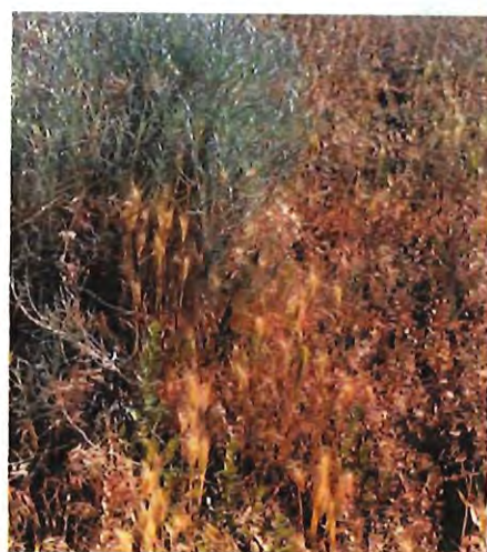
Medusahead and Cheatgrass growing in the Desert Creek area of Smith Valley