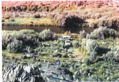
Inventory, mapping and treatment of noxious weeds along the riparian corridor

Noxious weeds are extremely difficult to eradicate; however, with diligence and willingness to expand management practices these projects can be successful. All parties involved have a better understanding of the necessary steps needed to protect their lands from invasion which includes additional herbicide treatments.