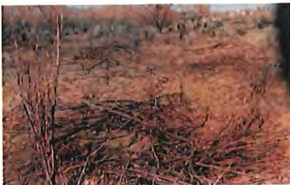
Tamarisk cut along the Walker River Corridor

The Bureau of Land Management has committed to weed treatment in the coming years through a cooperative agreement that can be renewed for up to five years. This agreement was not funded in 2016-2017.