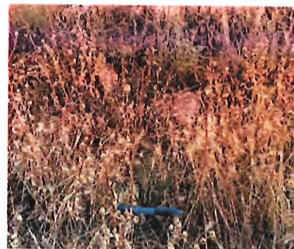
Desert Creek area following treatment with pre-emergent herbicide

Due to the negative impacts of Medusahead, control of relatively small infestations, such as this one, is imperative. This project is necessary to prevent further spread and future devastating environmental and economic impacts to Nevada and other western states.