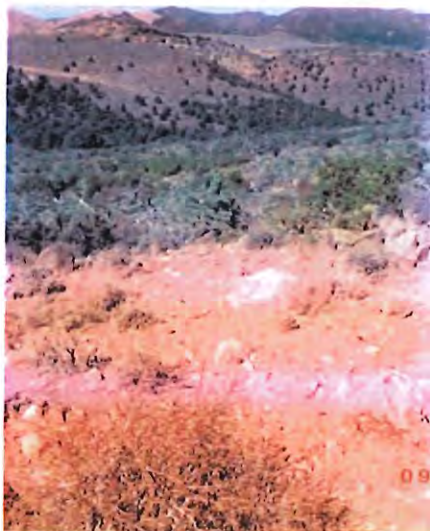
Big Lake Conifer Removal