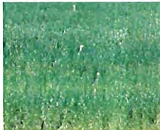
Sage Grouse In Sweetwater Ranch Alfalfa

Sage Grouse were observed in adjacent pastures, and will hopefully move into this new area.