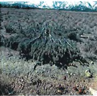
Treatment area after cutting

The Nevada Division of Forestry approached the Smith Valley Conservation District with a grant of $60,000 to cut, lop, and scatter pinyon and juniper on approximately 227 acres of the Sweetwater Ranch. There were about 213 acres of light density infestation, and we completed another 148 acres of medium density infestation. The funding was directed at fuels reduction to improve fire safety and decrease the available fuel close to the