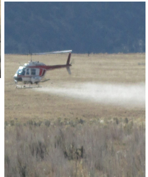
Aerial application of a pre-emergent herbicide to control medusahead and cheatgrass on a private property in Smith Valley