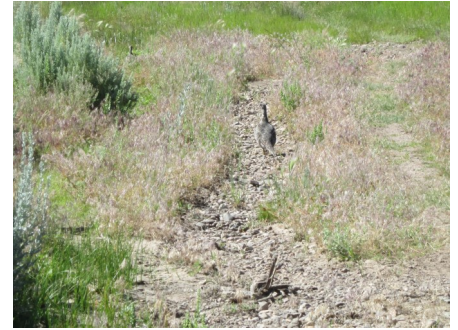
Female Bi-State Sage Grouse

9, 2020. The loan allowed the Districts to pay the employees while they were sheltering at home giving them job and financial security until we could resume office and field operations. This loan was forgiven April 13, 2021 based on the criteria that the proceeds were used for payroll purposes.