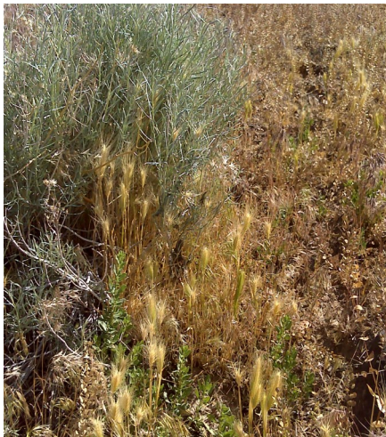
Medusahead and Cheatgrass growing in the Desert Creek area of Smith Valley