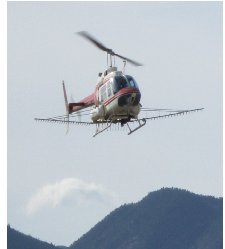
Returning to Reload

Annual monitoring is showing that the treatments are making progress at reducing the medusahead. We hope eradication is on the horizon!