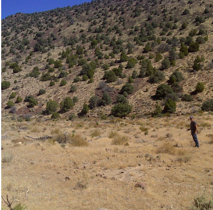
Buckskin Valley Sunrise Pass Pinyon Juniper Treatment Area

In October 2018, the Nevada State Department of Wildlife (NDOW) granted the Smith Valley Conservation District (SVCD) $11,970 to maintain a previous Pinyon Juniper removal project in Buckskin Valley. SVCD was able to complete 64 acres of Pinyon Juniper maintenance. This project was completed in December 2019. NDOW funded an additional $20,000 in December, 2019 to maintain additional acreage. The second phase was completed June 30, 2020. SVCD was able to treat an additional 208 acres.