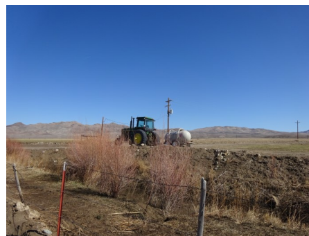
In-Kind Weed Control by Landowner

The Mason and Smith Valley Conservation Districts applied for and received a Payroll Protection Plan Loan that enabled them to retain their employees during the Coronavirus Pandemic Office Closure. District employees were not allowed in the office from March 19, 2020 till May