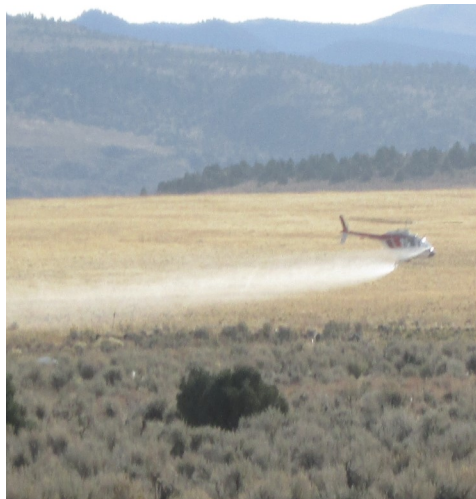
Aerial Herbicide Application