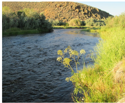
Tall Whitetop along the riparian corridor

dusahead area, it is very rocky. SVCD was able to treat the area with ATVs with sprayers using a pre-emergent herbicide in November, 2020. NDOW did a follow up inspection in May, 2021 and determined that the spraying project was approximately 90 percent effective. They are planning to seed the area this fall to jump start the revegetation process in the area and provide an additional desirable seed source for the area in the future