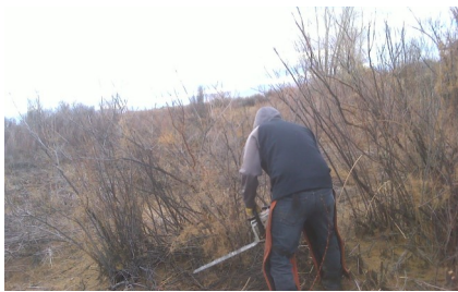
Tamarisk cut along the Walker River Corridor

The Smith Valley and Mason Valley Conservation Districts began a weeds for hire program in 2017, since there are no commercial weed treatment businesses in southern Lyon County. The program started slowly, but since 2019 Smith Valley Conservation District (SVCD) has been treating supply ditches and drains for the Walker River Irrigation District (WRID) and several ditch companies to reduce the transportation losses in the canals and enable more efficient movement of the water due to fewer obstructions. Several private landowners have taken advantage of the program as well.