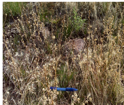
Desert Creek area following treatment with pre-emergent herbicide