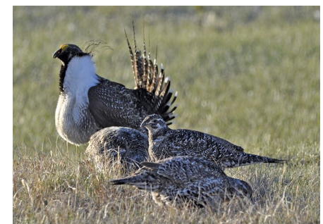
Bi-State Sage Grouse