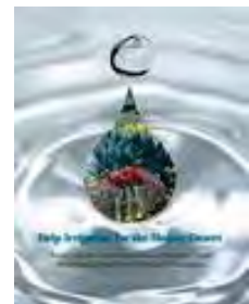
Drip Irrigation Educational Guide for residents – Partner: BOR