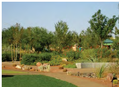
Acacia Demonstration Garden – Partner: City of Henderson