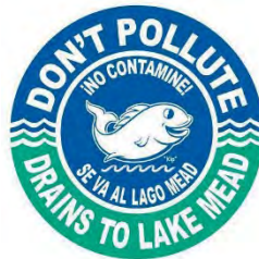
Storm Drain Marking Campaign – Partner: all municipalities, SNWA, NDEP