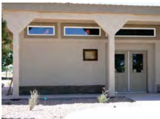
Straw bale Structure & Demonstration Garden – Partners: CCSD, DAQEM, Mesquite/Overton