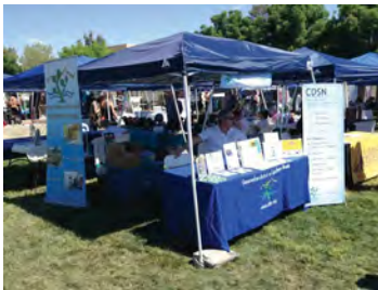
CDSN Booth at GreenFest