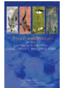
Clark County Wetlands Park Funding & Education – Partner: Clark County