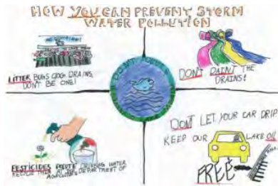
8 th Annual Stormwater Pollution Poster Contest Partners: CCSD, LVVWD, NDEP