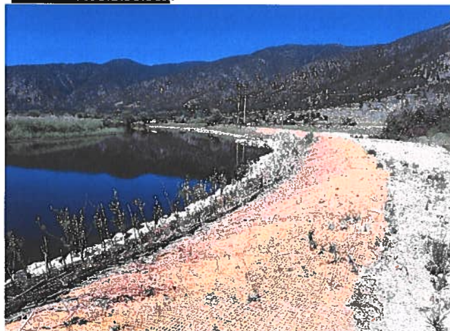
Down Steam looking up