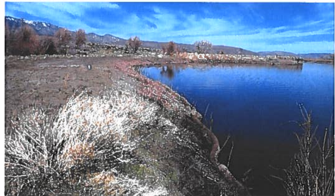
Down Stream looking up