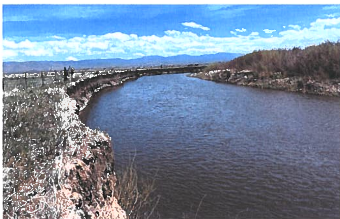
Down Stream looking Up