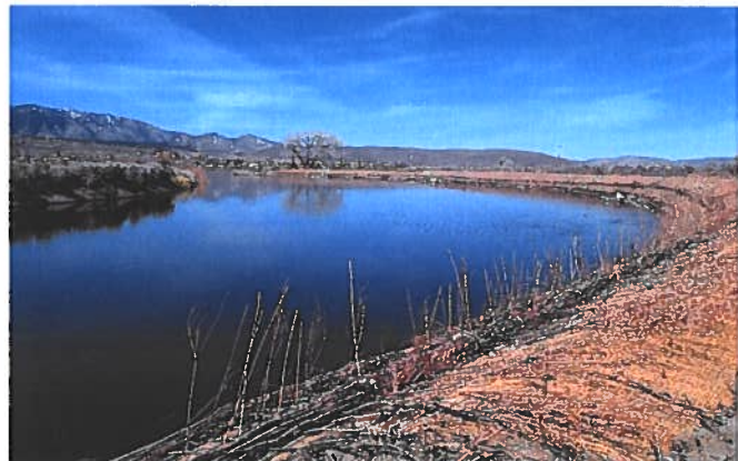
Up Steam looking down