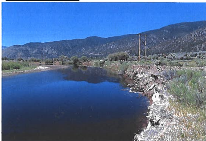
Down Steam looking up