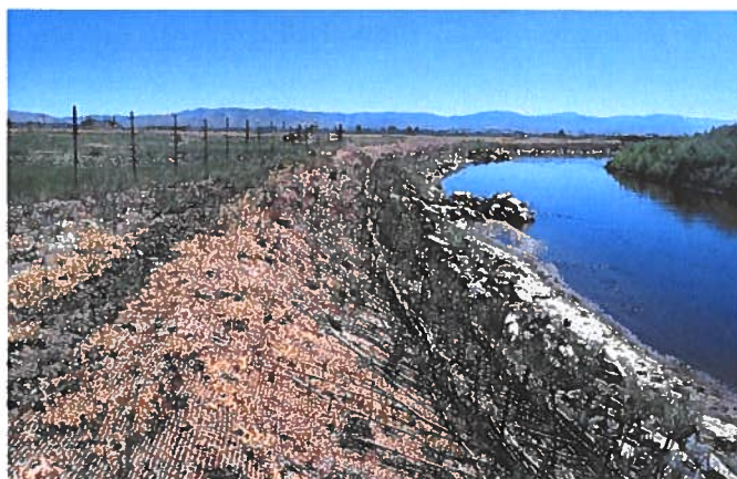
Down Stream looking Up