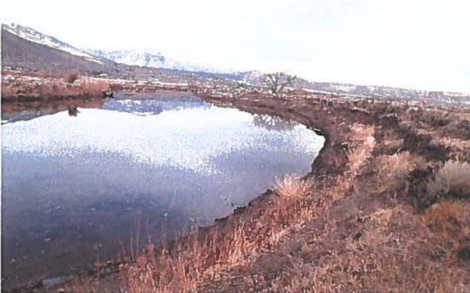
Up Steam looking down